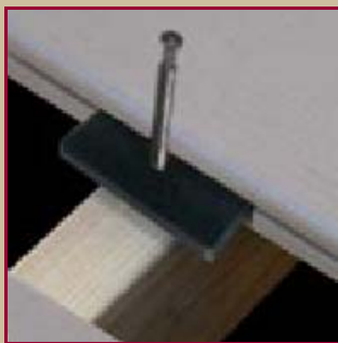
Cellek's fastener & groove design enables faster installment and a beautiful finish with no screws on top.